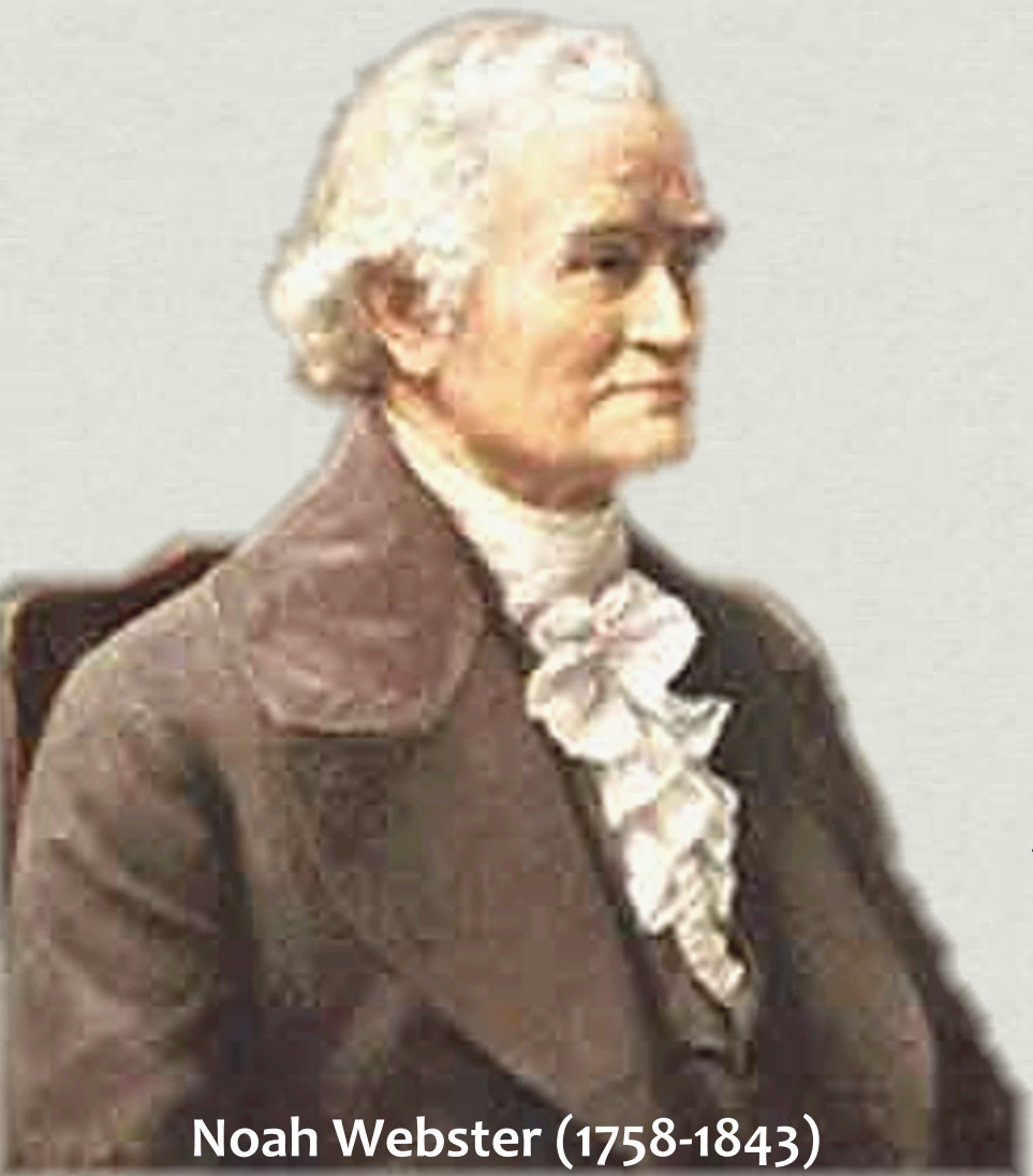
Noah Webster (1758-1843)

“Innumerable are the prejudices of education; we are accustomed to believe what we are taught, and to receive opinions from others without examining the grounds by which they can be supported. A man has strong prejudices in favor of his country or his party, or the church in which he has been educated; and often our prejudices are unreasonable. A judge should disabuse himself of prejudice in favor of either party in a suit.”