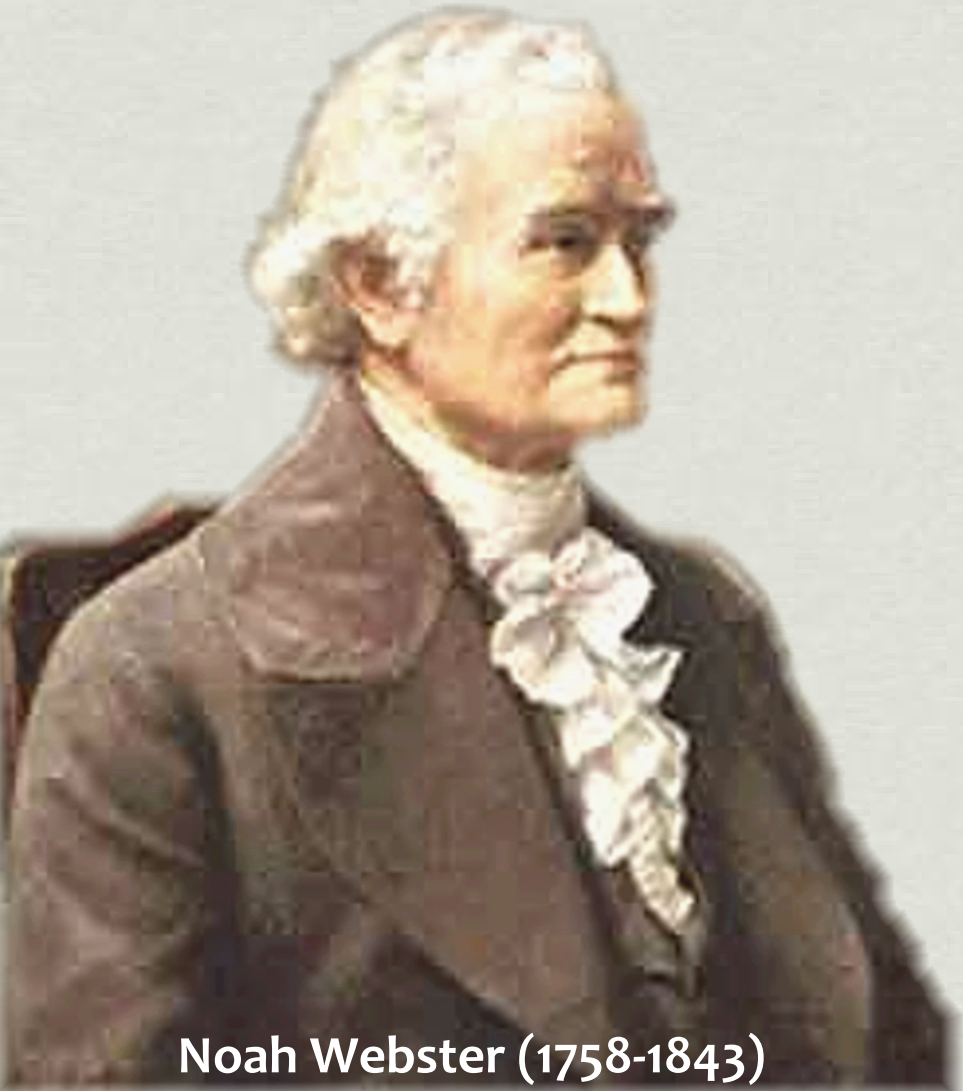
Noah Webster (1758-1843)