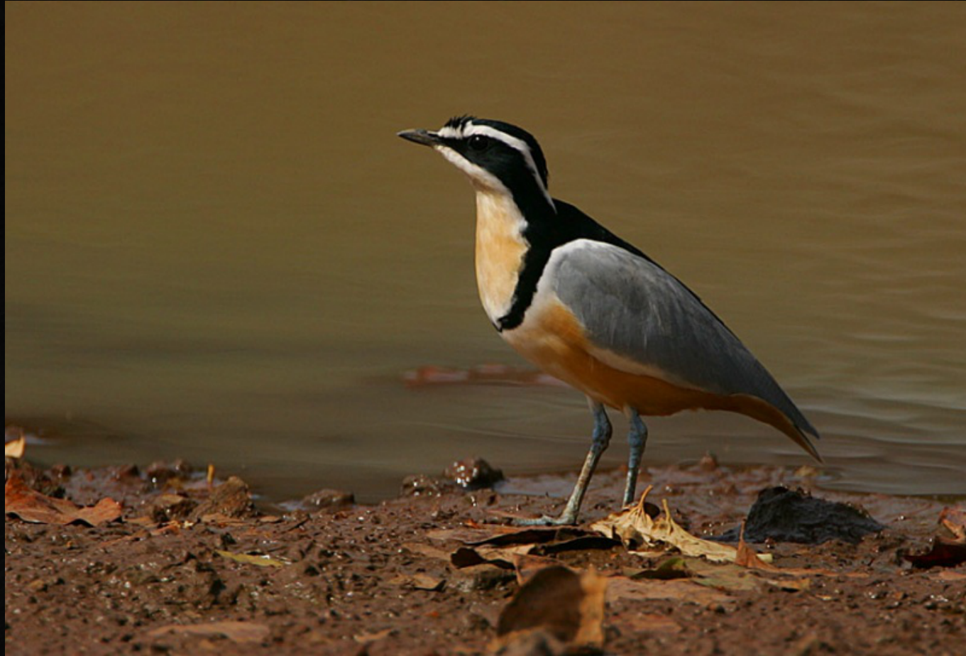
The Egyptian plover bird