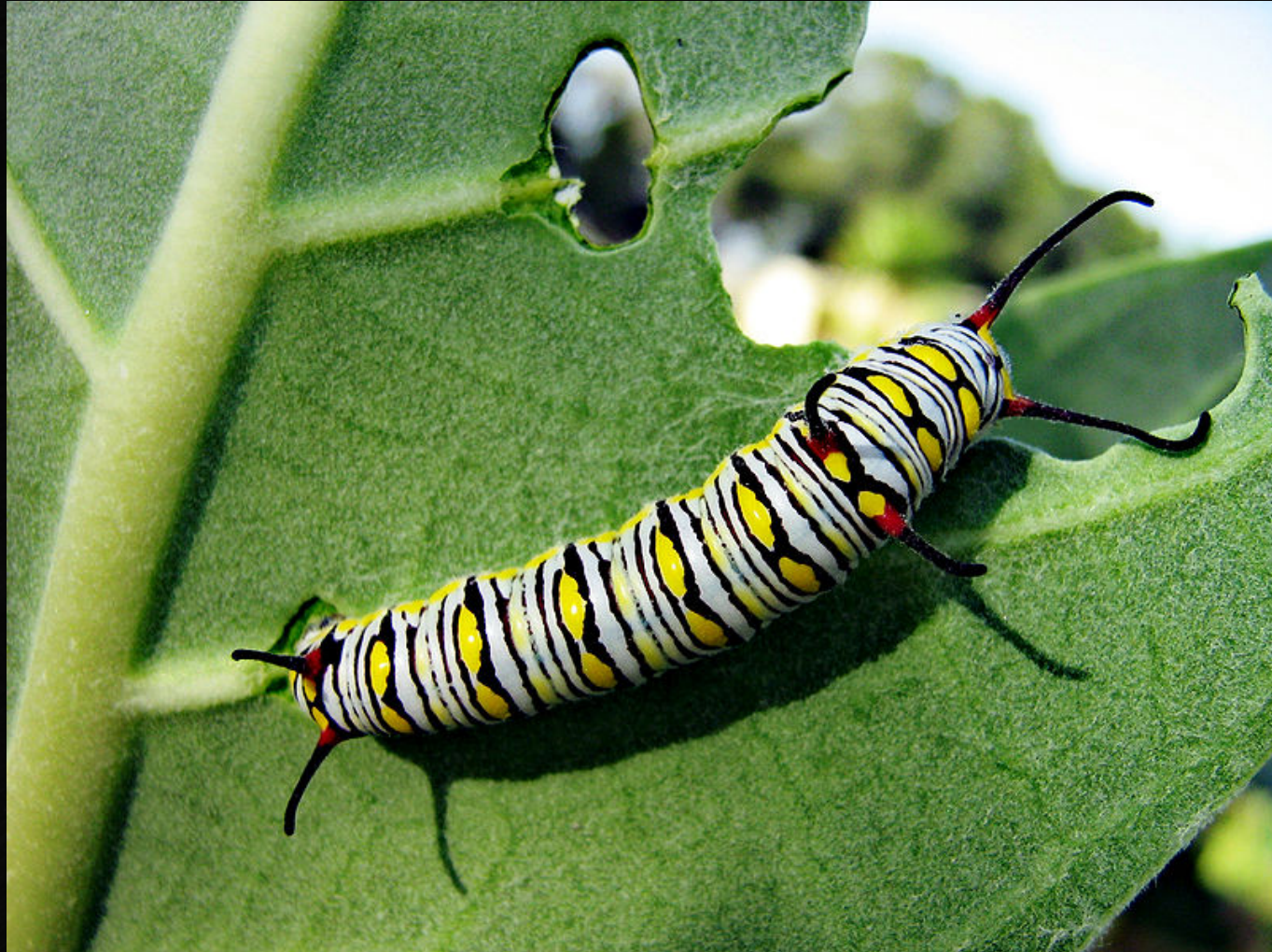
The monarch butterfly caterpillar